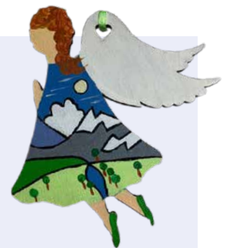
ABOVE: A hand-painted 'Ukraigel' from L'Arche Lviv, in the Ukraine.

Please take advantage of this great opportunity to show us what you make. All the better if you can share photos of people engaged in the production process. Please be on the lookout for the May mid-month letter for more info. Note: unfortunately, we can't handle online sales! But this way of advertising could well result in orders for goods being placed directly with your community! A golden opportunity!